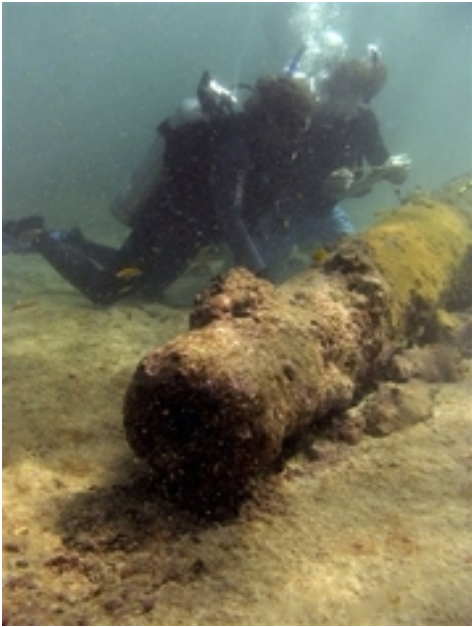
Two Indiana University graduate students working on the wreck...