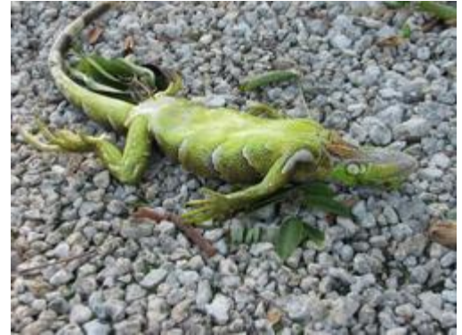
This Tavernier iguana (top) is in basically a state of suspended animation due to the cold temperatures. This other one (below) is what the reptiles normally like when the weather is warmer.

For those concerned about the fate of their local iguanas, Mader said to leave them alone unless the lizards fall prey to domestic animals or cars. "Just move them someplace outside where they'll be safe," he said. "You can touch them; you're not going to get sick by touching an iguana." For more information about iguanas in Florida, visit http://edis.ifas.ufl.edu/IN528 .