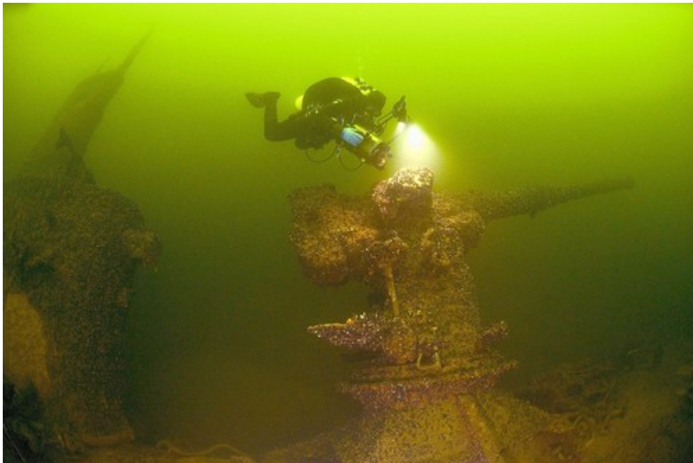
(AFP/Getty photo by Stefan Hogerborn / June 9, 2009)

Reprinted from http://www.chicagotribune.com/features/chi-pod-pix,0,6615505.photogallery