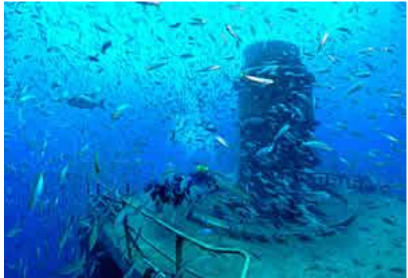
Schooling fish during a dive on the Vandenberg artificial reef

KEY WEST, Florida -- It took less than two minutes for the Gen. Hoyt S. Vandenberg to reach the ocean bottom off Key West May 27, 2009, yet within a year it has bloomed into a timeless circle of life in the Florida Keys National Marine Sanctuary.