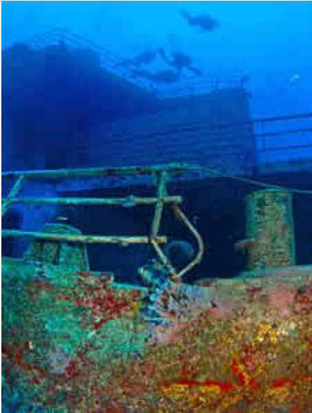
Diving the Vandenberg off Key West, Florida