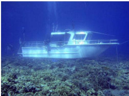
On the bottom: Maui Dive Shop's 'Kai Anela' dive boat filled with water and sank because the captain did not understand that the inspection hatch of the vessel's jet propulsion unit was located below the waterline.