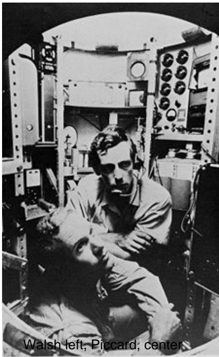
Walsh left, Piccard, center

times that; the equivalent pressure of more than eight tonnes per square inch. To make such a pioneering dive to these extreme depths required the utmost courage and determination. Piccard and Walsh's moment of greatest resolve came four hours into the Challenger Deep dive. At a depth of 9,000m, with a resounding bang, one of their Perspex windows cracked. Remarkably, they chose to continue their descent, arriving at the bottom 40 minutes later.